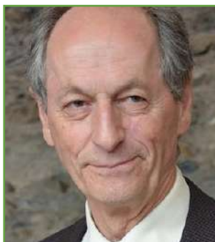
Professor Sir Michael Marmot Director of the Institute of Health Equity (UCL Department of Epidemiology & Public Health)